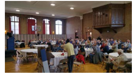
Bishop Deeley opened the event and over 150 men were in attendance.